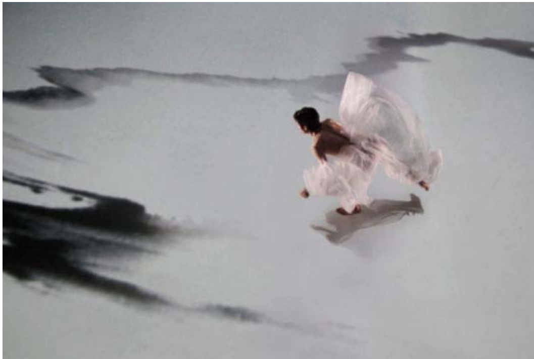
Cloud Gate Dance Theatre will perform 'Water Stains on the Wall.'

Updated 01:51 p.m., Friday, December 30, 2011